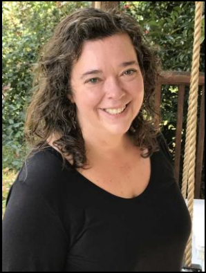
Jill St. John 6 th